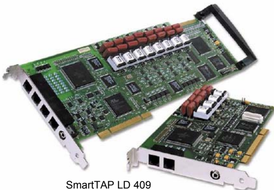
SmartTAP LD 409