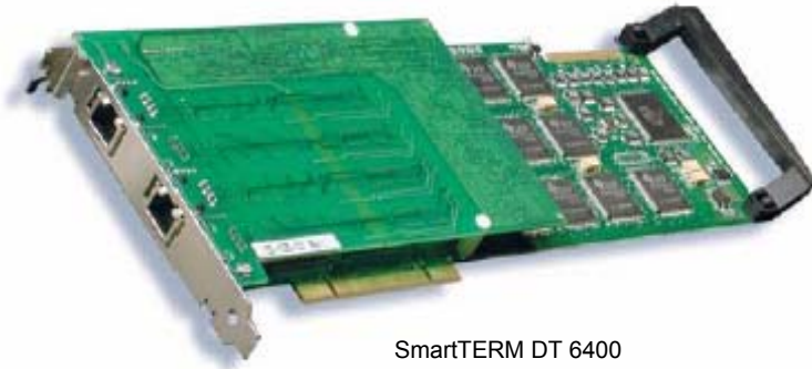
SmartTERM DT 6400